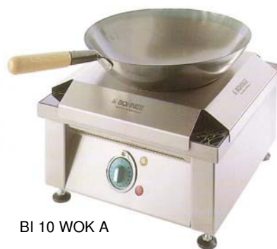
BI 10 WOK A